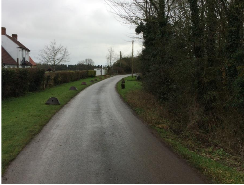
1-B: Tussocky Grass / Scrubland