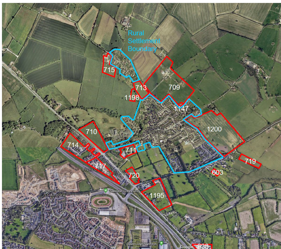
Figure 2-2: Map of Sites that the Swindon SHLAA 2013 assessed as being suitable, available and achievable for development and which fall within the Blunsdon East Neighbourhood Plan area