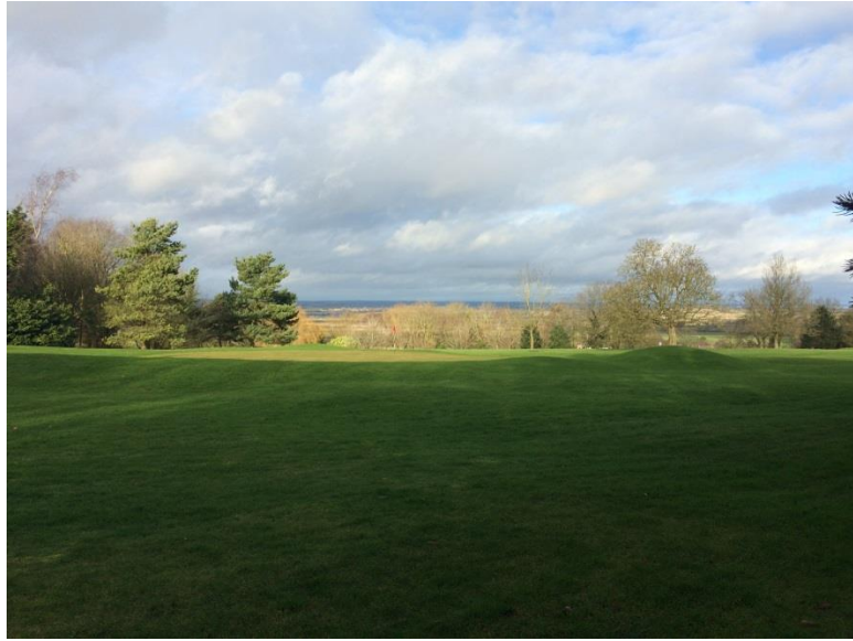
8-B: Badger Sett