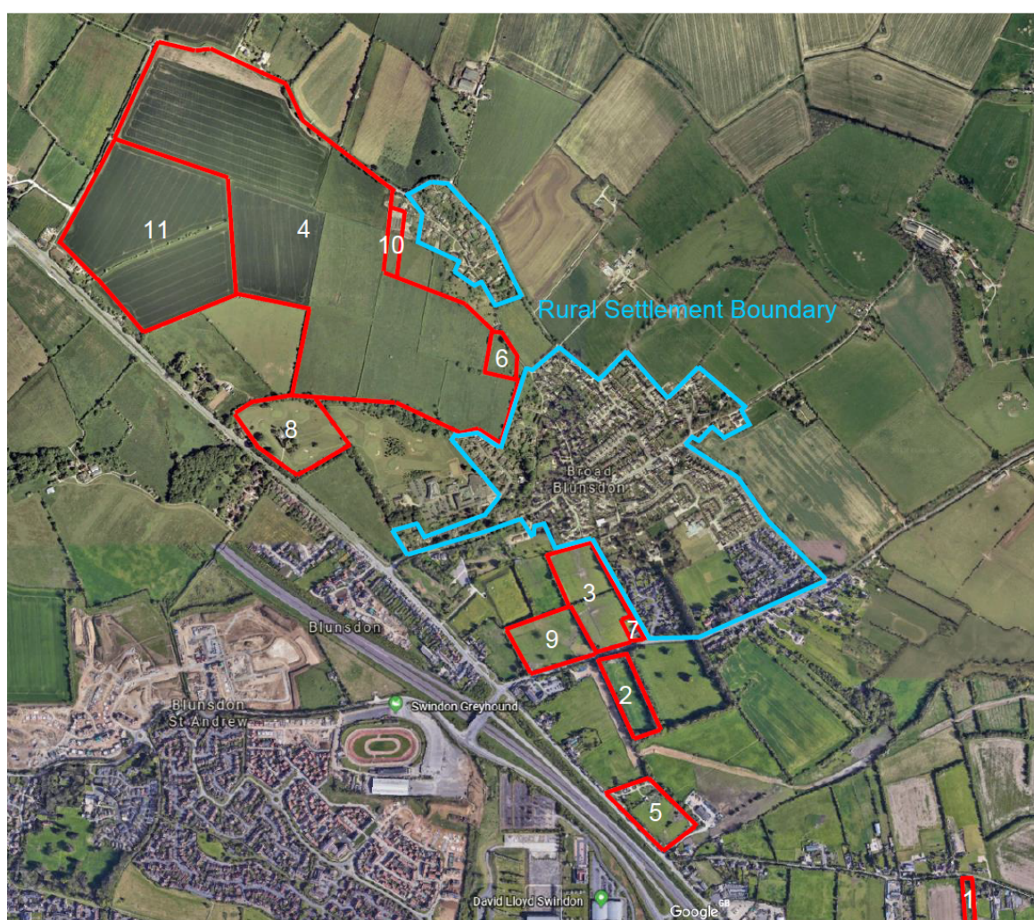
Figure 2-1: Map of Sites identified through Neighbourhood Plan Steering Group Call for Sites

All sites identified through Neighbourhood Plan Steering Group Call for Sites are shown on Figure 2-1 .