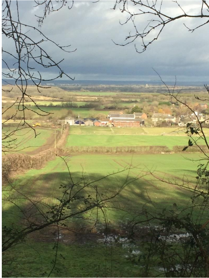
4-A: View from Higher Land