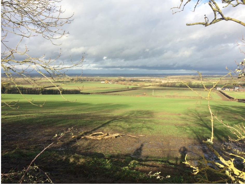
4-D: Rising Land