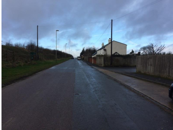
5-E: Listed Building – The Old School