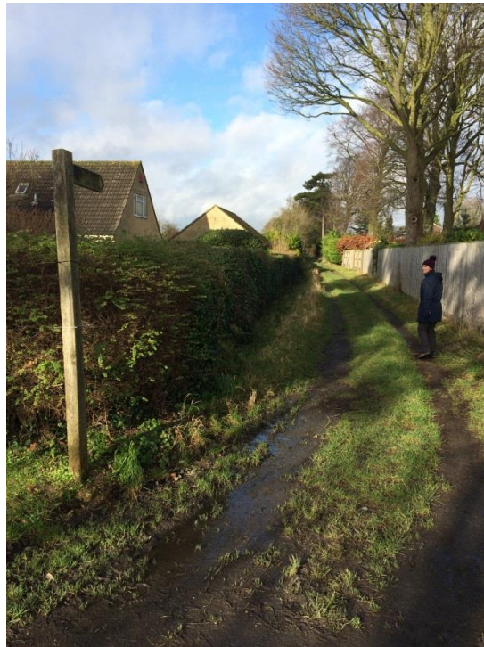
7-D & 7E: B4019