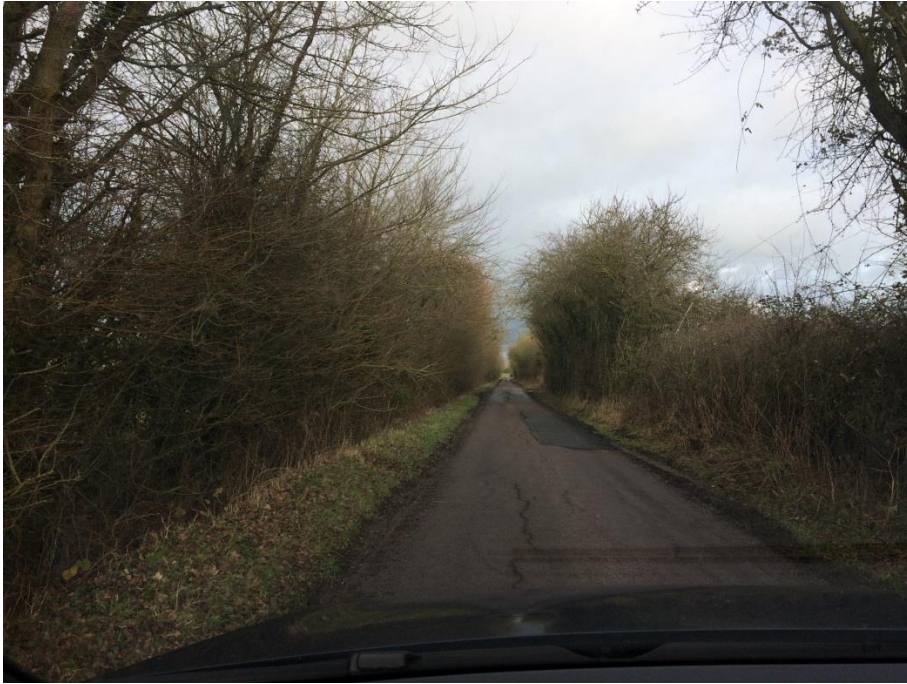
4-B: Agricultural Land