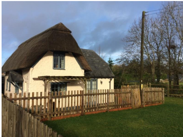
5-F: Overhead Power Lines