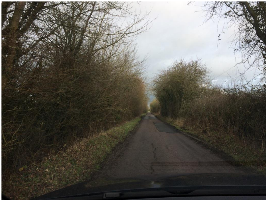
4-A: Front Lane