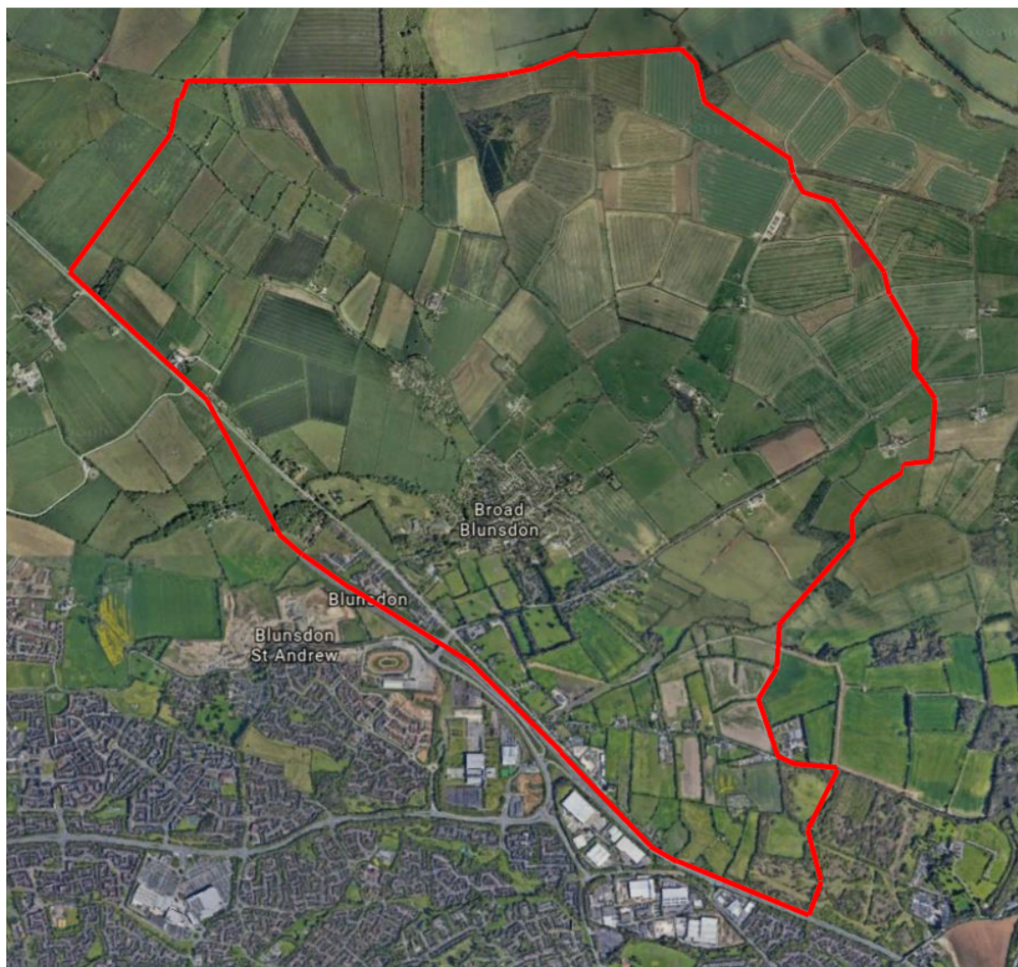
Figure 1-1: Blunsdon East Neighbourhood Plan Area