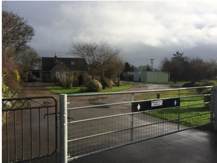
5-B: Grazing Land