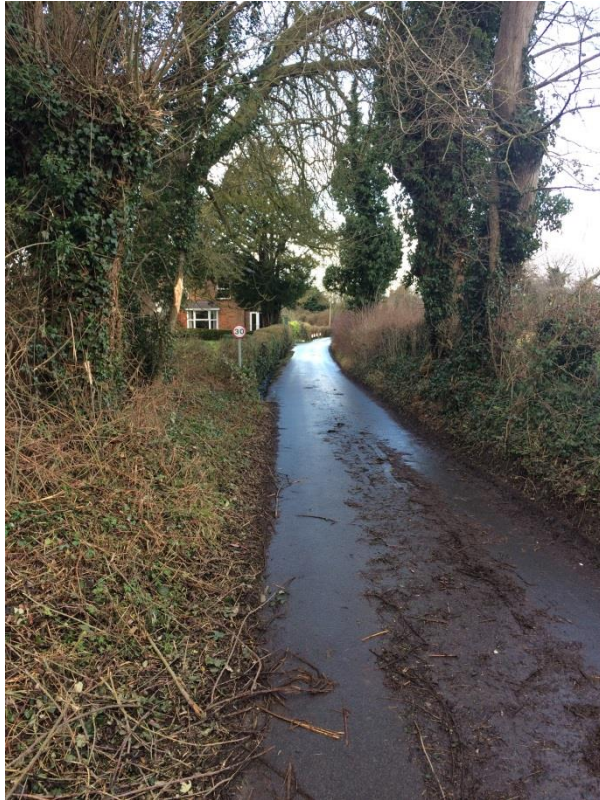
6-B: Tussocky Grass / Scrubland